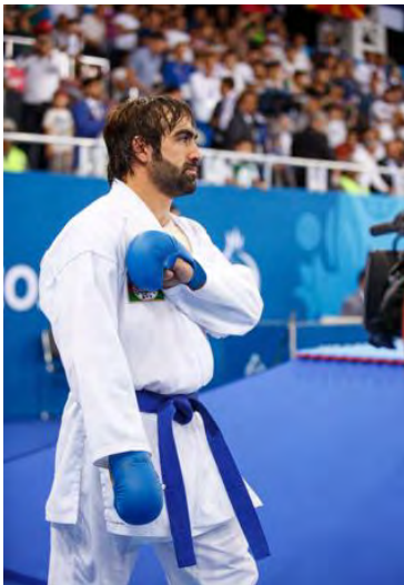
Rafael Aghayev World and European Champion in Kumite